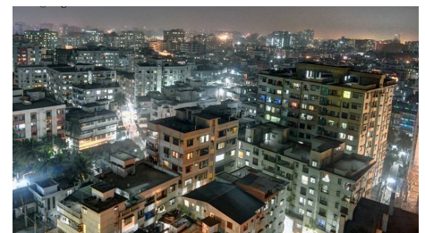
Figure 30.3: Dhaka, Bangladesh